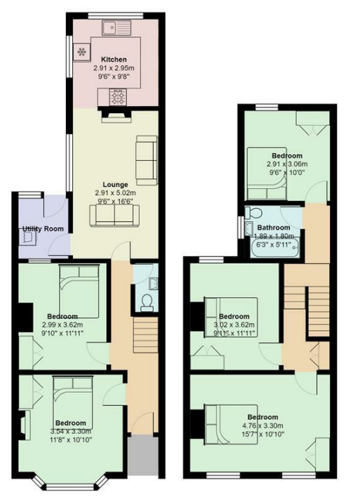
Mackintosh Place, Roath

Total Area: 111.4 m 2 ... 1199 ft 2 All measurements are approximate and for display purposes only